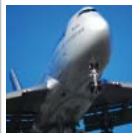
SIFEL is expected to find applications in fields such as transportation, where it will be subjected to severe conditions.

SHIN-ETSU SIFEL®, Shin-Etsu's liquid fluoroelastomer, is a completely new type of fluoroelastomer, the first in the world to be made using a heat curable silicon rubber addition reaction technology. SIFEL has superior processibility and functional characteristics such as better resistance to oils, solvents, chemicals and heat. Moreover, unlike conventional fluororubbers, SIFEL has superior cold-resistance. With a variety of applications, these products are used in rubber molds and as sealants in vehicles and aircrafts. Recently, SHIN-ETSU SIFEL® has been used in electronic components to protect semiconductor devices from moisture and as a protective coating for high-frequency devices, thus, contributing to enhanced reliability of these components. Based on its attractive characteristics, we anticipate SHIN-ETSU SIFEL® will be used in an increasing number of application areas.