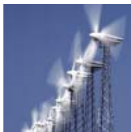
Shin-Etsu's rare earth magnets are used in wind turbine generators.