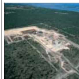
Simcoa Operations Pty. Ltd. engages in the manufacture of silicon metals.

The Shin-Etsu Group manufactures an abundant lineup of products including synthetic pheromones and acetylene derivatives. Synthetic pheromones have been developed as agents to control the populations of harmful insects that attack cotton and fruits. They act by disrupting the insects' mating