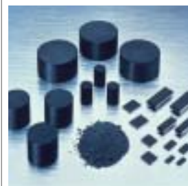
Epoxy molding compounds prevent semiconductor circuit leaks, protect regular and large-scale circuits from humidity, and are outstanding in terms of heat and shock-resistance.