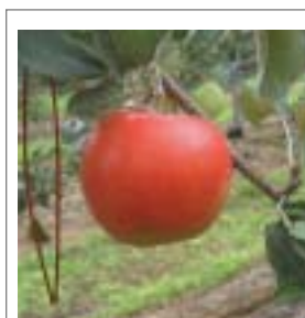
Used at fruit orchards, synthetic pheromones control the populations of harmful insects by disrupting the insects' mating behavior.