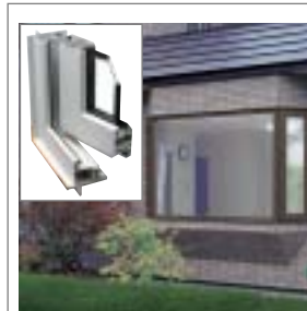
PVC used in sash for window frames has superior heat-retention capabilities contributing to energy conservation, and acts to prevent condensation for a more comfortable living environment.

Shin-Etsu will continue to capitalize on its strengths in production capacity and efficiency, as well as its strong sales capabilities nurtured in the world market.