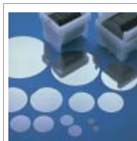
Silicon wafers boast a degree of evenness to within 0.1 micrometer.

multifunction and higher-performance chips, and to enable manufacturers to achieve a twofold increase in the production of chips compared with the existing 200mm wafer, will generate significant benefits for device makers in terms of cost reductions. In response to the growing trend toward smaller devices and more sophisticated demands from customers, we pioneered the development of technology that enables us to produce stable supplies of high-quality, next-generation 300mm wafers, commencing commercial production in February 2001. In recent years, we have expanded our facilities in Japan with the aim of securing the top share in 300mm wafers.