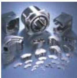
Examples of voice coil motors for hard disk drives (HDDs)

Today, Shin-Etsu is the only company in the world to carry out integrated production of high-quality rare earth magnets from high-purity rare earth to the finished product. Leveraging this position, we will ensure stable supply and the highest product quality, while swiftly developing new products and applications that match the needs and objectives of customers.