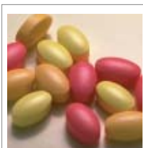
Cellulose derivatives for pharmaceuticals are used as coatings for pills. The material can be adjusted to allow release of the medicine in the stomach or intestines and to provide sustained release.

As another important business, Shin-Etsu also manufactures silicon metal. Silicon metal is an essential raw material in such products as silicones, semiconductor silicon, and synthetic quartz, which are among the Group's core businesses. Through its wholly owned subsidiary in Western Australia, Simcoa Operations Pty. Ltd., the Company is securing stable, long-term and high-quality supplies of this valuable commodity.