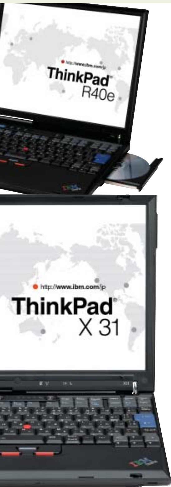
IBM ThinkPad is a registered trademark of IBM Corporation.