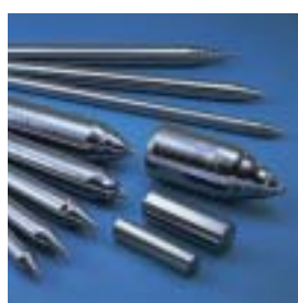
Examples of wide-rimmed single crystal silicon ingots

Shin-Etsu Handotai Co., Ltd. (S.E.H.)'s Shirakawa Plant boasts a top market share in commercial production of 300mm wafers. S.E.H. has been receiving overwhelming inquiries mirroring the shift toward 300mm wafers and we are expecting increased demand particularly for memory, microprocessor, and logic applications. As of the end of March 2003, our Shirakawa Plant had a monthly manufacturing capacity of 100,000 units. We have announced plans to expand production for 300mm wafers to 300,000 units per month in response to the increase in future demand. In addition, we anticipate the next-generation 300mm wafer, which can be used to manufacture