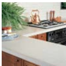
Silicone works to improve the efficacy of the resin modification agent used in artificial marble.

Overseas, the Shin-Etsu Group has adopted an active policy of locating production close to the regions where the products are marketed. The Group is making every effort to expand sales and has commenced production of specialty silanes at a new plant in Texas in the United States, and of emulsion products and liquid-type RTV rubber compounds at a new plant in Zhejiang, China. In Thailand, Shin-Etsu has formed a joint venture with the U.S.-based General Electric Company to manufacture silicone monomer; at the same time, Shin-Etsu is constructing its own silicone polymer manufacturing plant in Thailand. Shin-Etsu will work toward early start-up of these new production