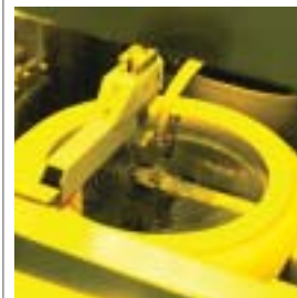
Photoresist spin-coated onto a wafer

Shin-Etsu has set up a system to supply the main materials essential in the lithography process utilized by semiconductor device manufacturers. For this purpose, Shin-Etsu maintains a close bond with the semiconductor industry. In utilizing this unique position, we are working in parallel with users in the development of the next-generation argon fluoride (ArF) photoresist.