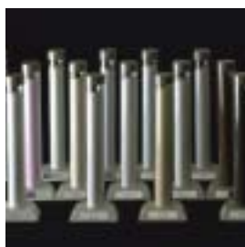
Rare earths are the general designation for 17 elements, including the 15-element Lanthanides series plus Yttrium and Scandium.