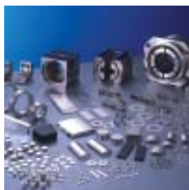
Rare earth magnets have various applications in everyday life such as in headphone stereos and in optical pickups in CD and DVD players.

By using our original high-level separation and refining technologies and physical properties control technologies for rare earth products, we have attained rare earths with 99.9999% purity. These rare earths are used for a wide assortment of applications, including the luminescent center of lasers, phosphors for color television sets and fluorescent lamps, and oxygen sensors and catalytic converters for automobile engines. Looking ahead, we anticipate that the number of applications for these rare earths will grow even further.